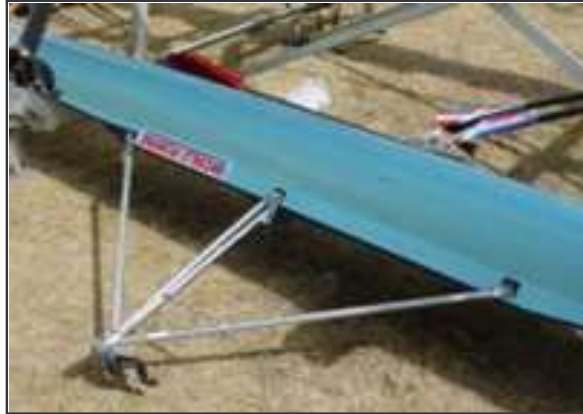
Traditional 4 stay aluminium rigger