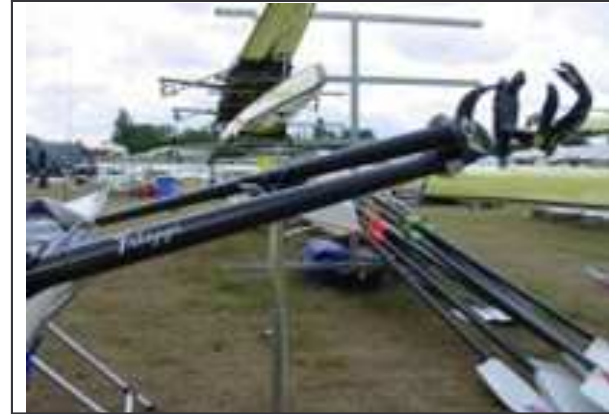
Fillippi 2 stay carbon rigger